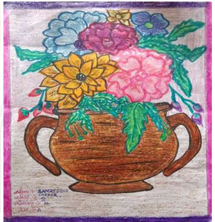
-SAMRIDHA SARKAR, IV