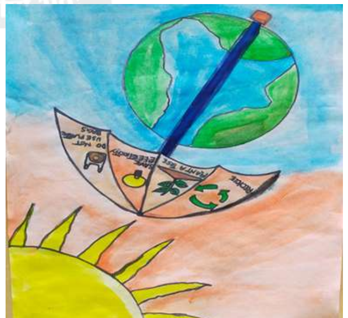
-ADITI NAWLAKHA, VII