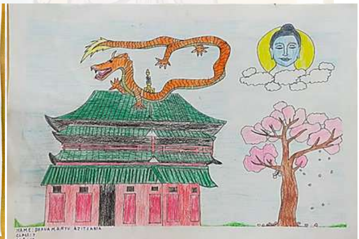
-BHAVAMANYU AJITSARIA, VII